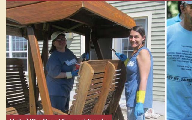
United Way Day of Caring at Crowley House. Thank you, volunteers!