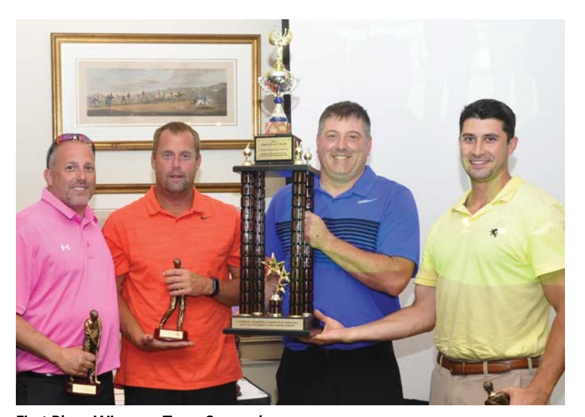
First Place Winners: Team Spagnolo