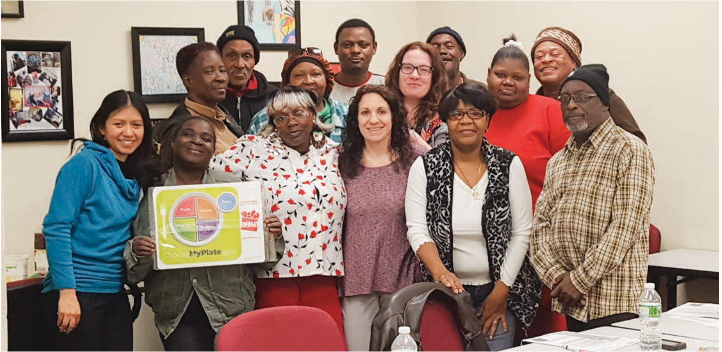
Consumer Advisory Board Members set the example for eating and living healthy.