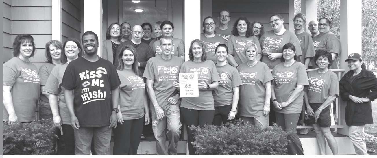
Residents and staff enjoy working with United Way Day of Caring volunteers to spruce things up at our 13 residential homes.