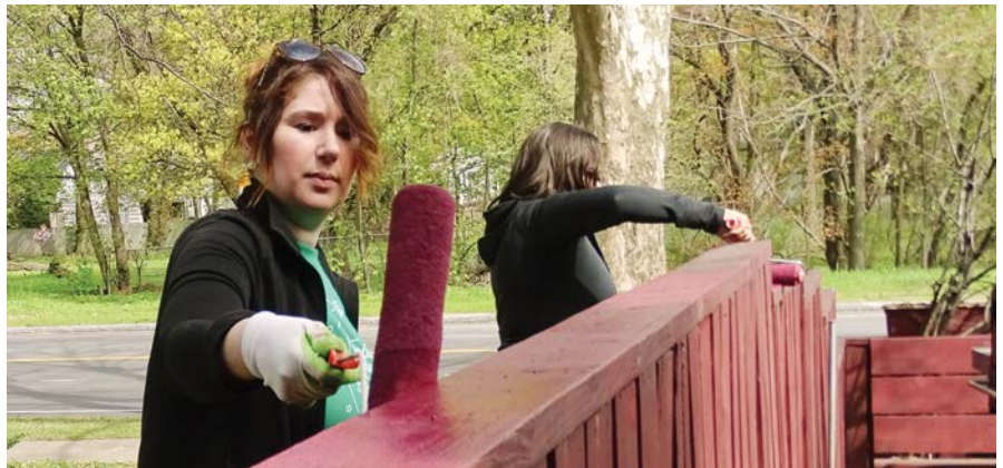
A fresh coat of paint makes everything bright for springtime at our Newcastle location.