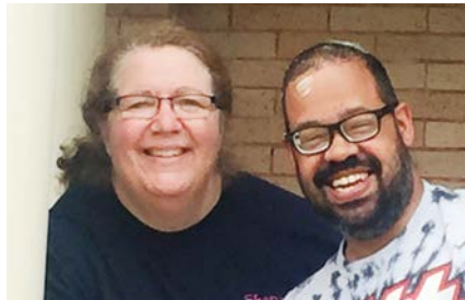
Staff and residents, alike, take pride in working together with our volunteers on Day of Caring.