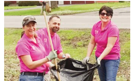
Many hands make light work of raking fall's leftover leaves at one of CCCS' residential sites.