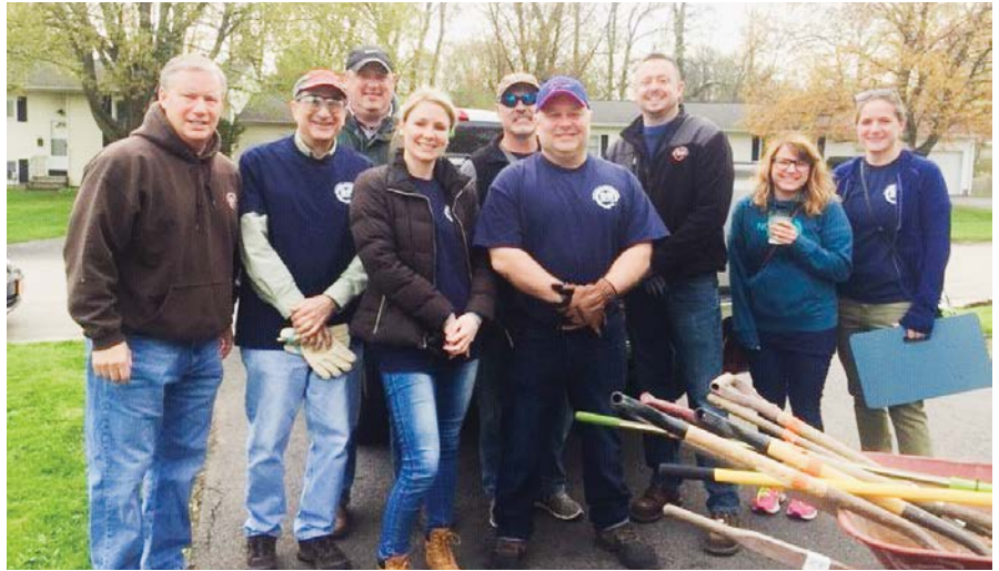
Schuler-Haas Electric Corp. takes care of our Westerloe house.