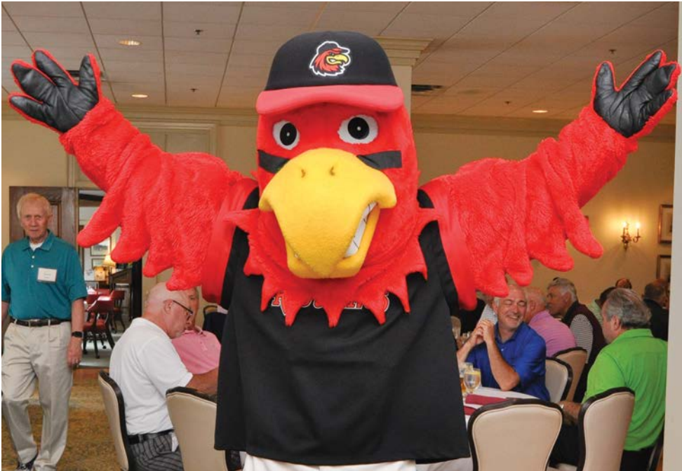
Spikes really loves CCCS, and he will be joining us at Frontier Field on August 22nd.