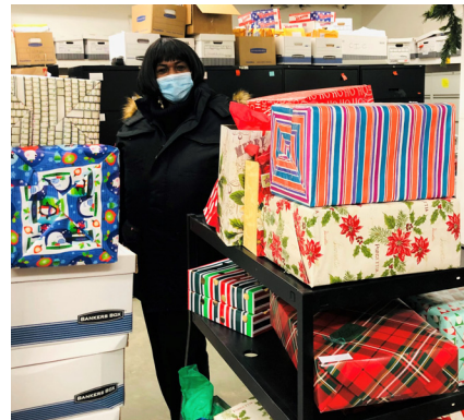
▲ Staff helps deliver the holiday cheer!

Thank you to our dear friends at Woodcliff Hotel & Spa for once again donating 300 turkeys for our clients! This is their ninth year of giving our clients the gift of a Thanksgiving turkey, and we are so in awe and thankful of Woodcliff's generosity. This year, one in which businesses and individuals alike are all struggling, their compassion and kindness is truly a shining star.