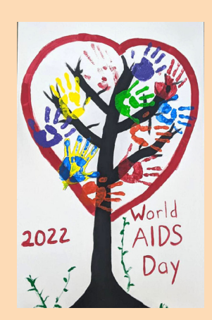
95% of our clients with HIV/AIDS have viral loads that are undetectable and 90% are compliant with HIV testing.

CCFCS offers on-site mental health services to students at three charter schools in the city of Rochester.